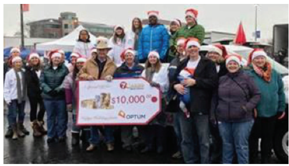
7Cares Idaho Shares day in Boise, Idaho