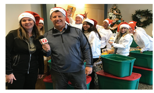
Live Broadcast at the Optum Office for 7Cares Idaho Shares