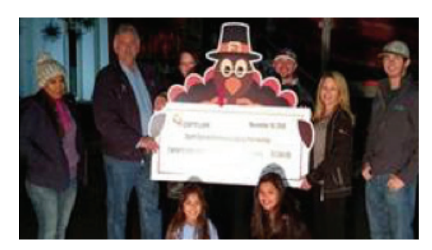
Donation to the S. Central Community Action Partnership